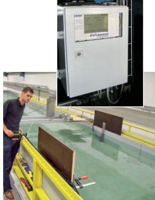
Testing section and test item (above).

The water levels in the tipping trough were measured with a type HTD ultrasonic echo sounding instrument and an EA94 signal converter. Its special sensor concept eliminates influences of temperature and atmospheric humidity on the sound velocity. For this device, the manufacturer specifies a measuring uncertainty of \pm 1\text{mm} .